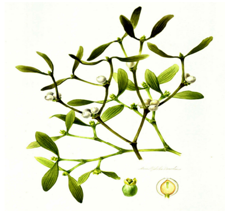
European Mistletoe ( Viscum album )